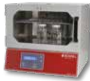
TTT Incubator – 135000