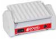
Variable Speed Tube Rocker 280150