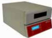
RapidFISH Slide Hybridizer Hybridization Oven – 240200