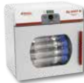
Big Shot III TM Hybridization Oven– 230402