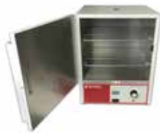
Economy Digital Incubator – 133000