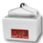
6L – 290100