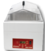
28L – 290300