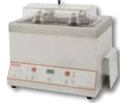
Plasma Thawer – 301000