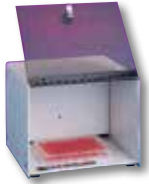
Rear Heated Mini Economy Incubator – 260700