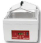
14L – 290200