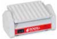
Fixed Speed Tube Rocker 260450