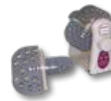
Mini Tube Rotator with Carousel – 260750